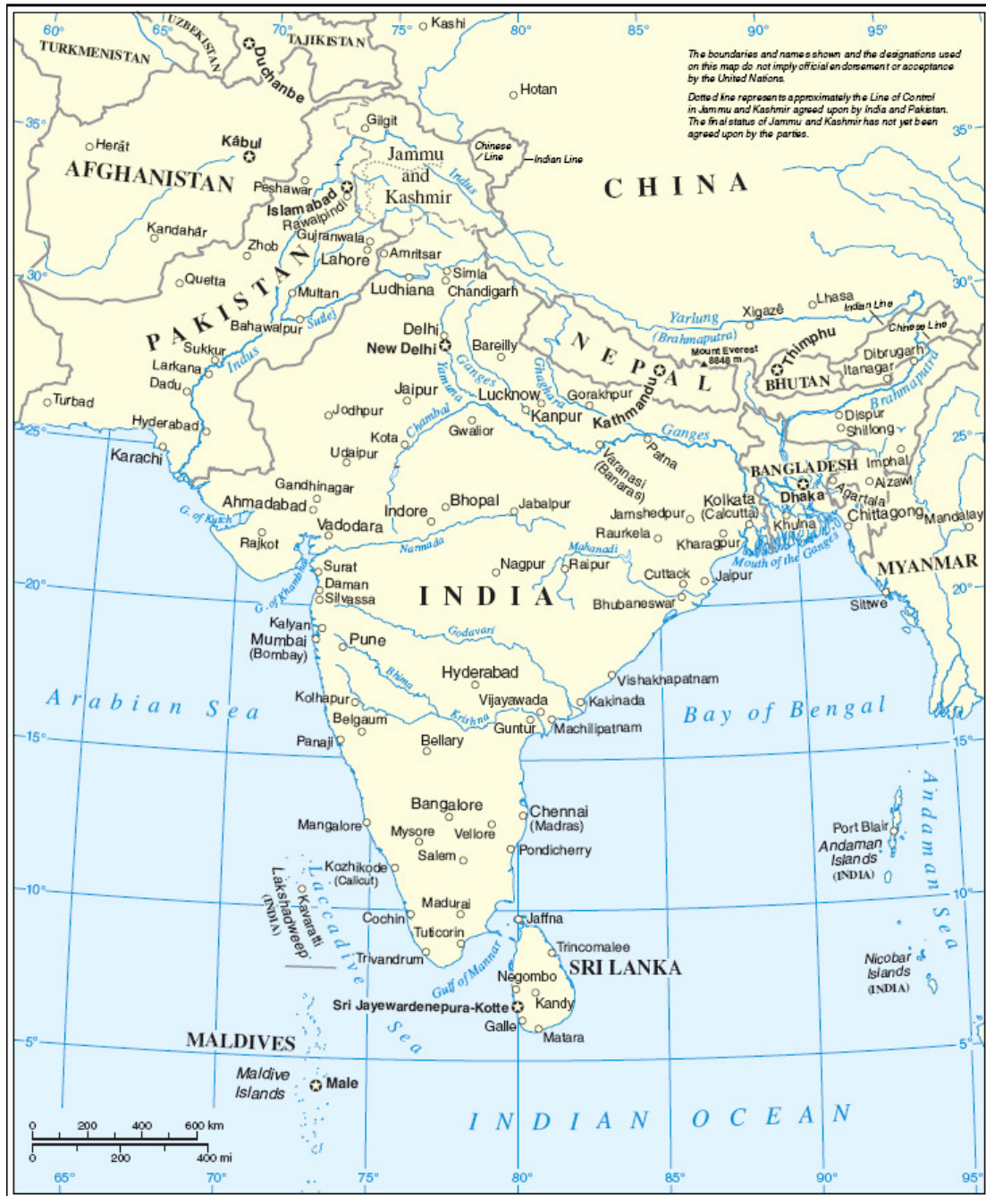
Map No. 4140 Rev. 3 UNITED NATIONS January 2004