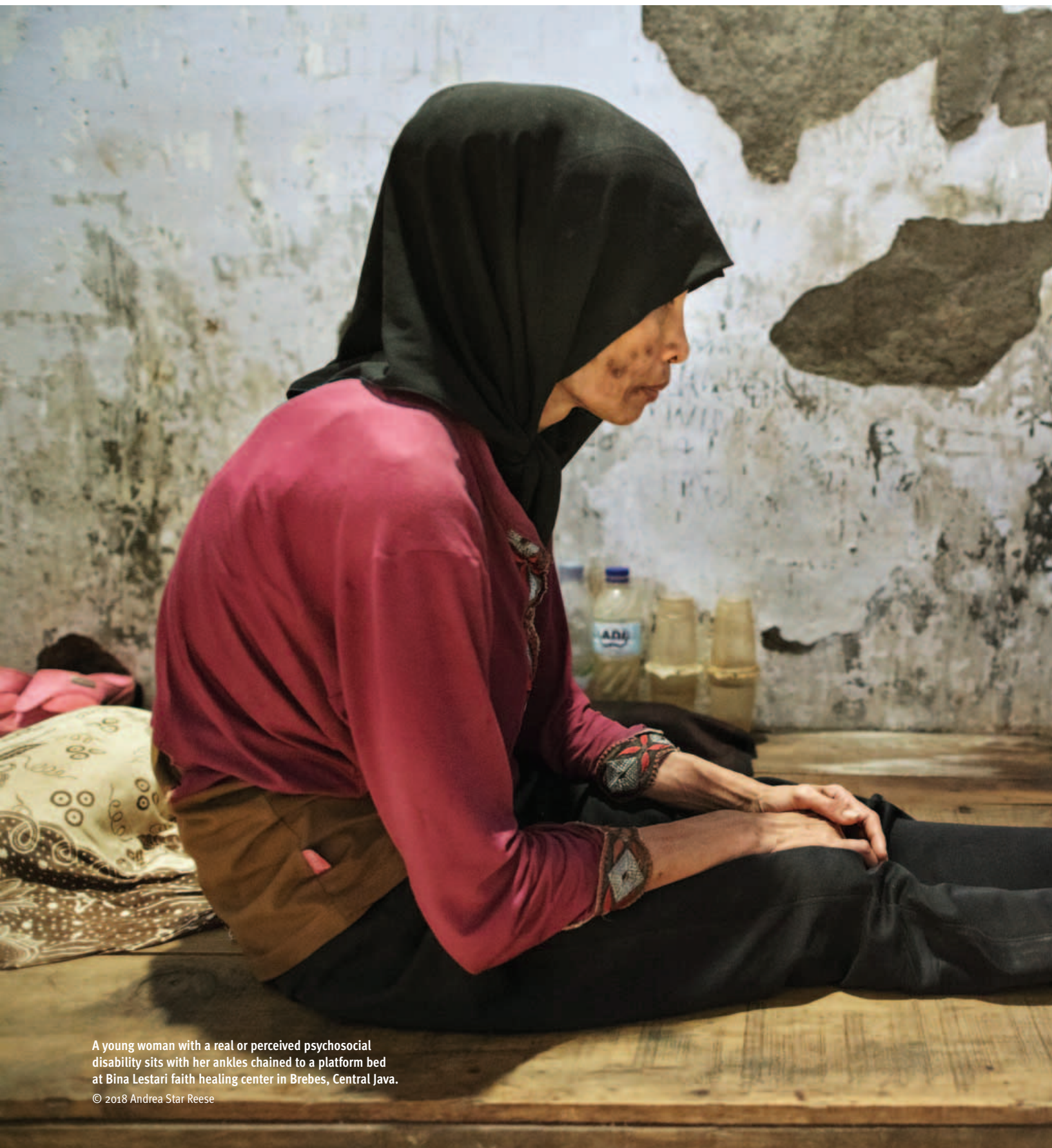
A young woman with a real or perceived psychosocial disability sits with her ankles chained to a platform bed at Bina Lestari faith healing center in Brebes, Central Java.