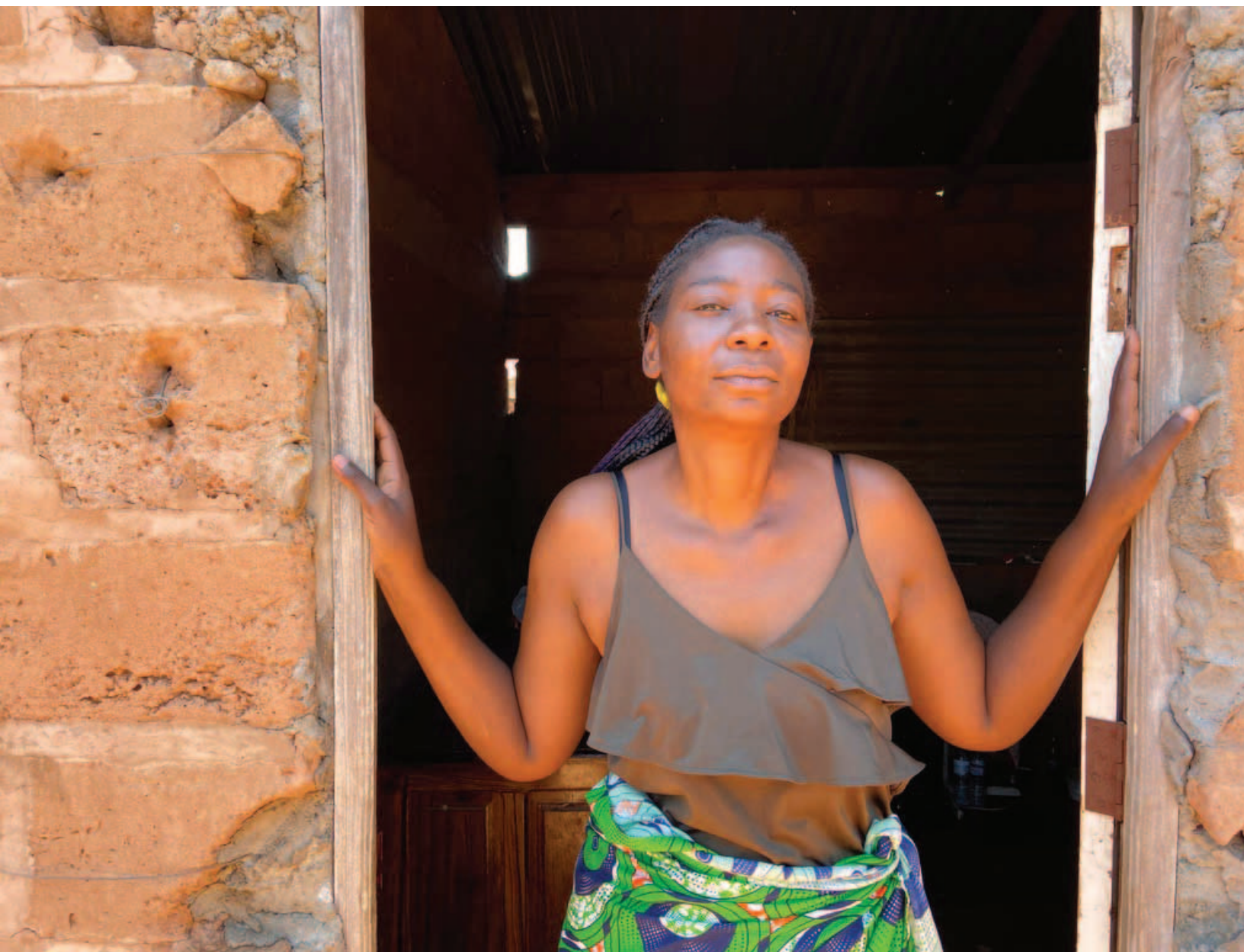
Fiera, 42, stands in her doorway in Maputo, Mozambique. She volunteers with a local organization that advocates for the rights of people with psychosocial disabilities after she was forcibly confined and tied down because of her mental health condition.