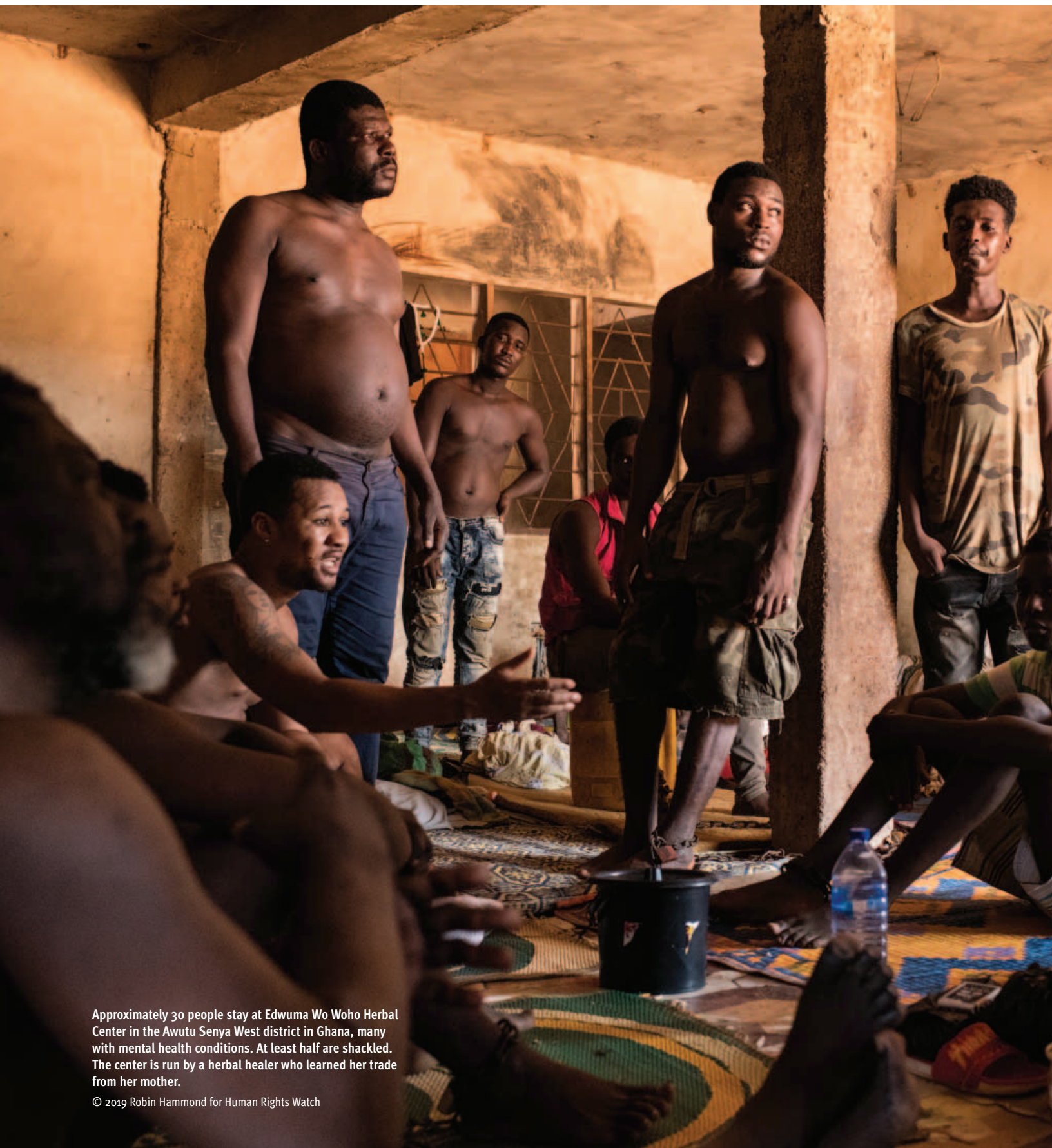
Approximately 30 people stay at Edwuma Wo Woho Herbal Center in the Awutu Senya West district in Ghana, many with mental health conditions. At least half are shackled. The center is run by a herbal healer who learned her trade from her mother.