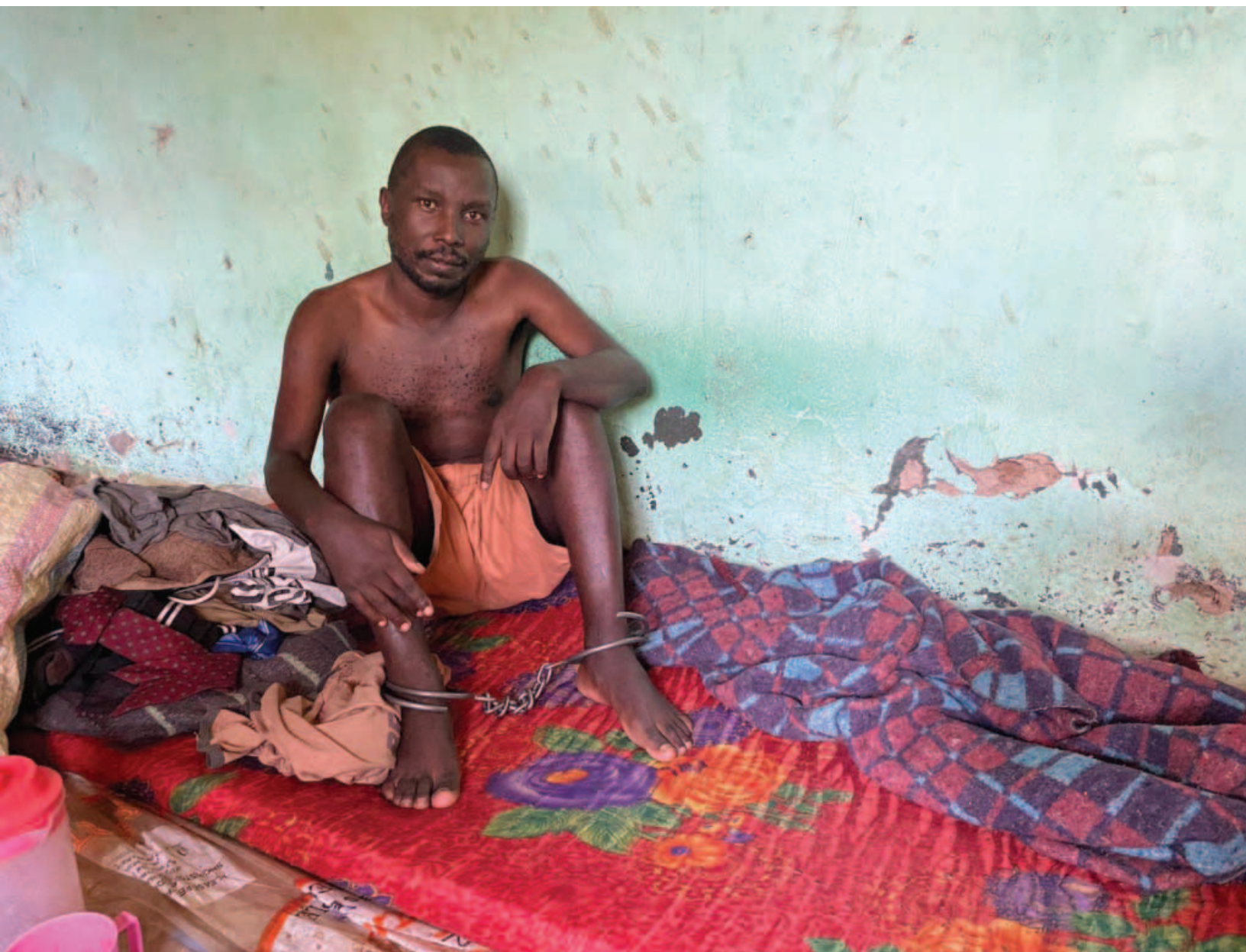
A man with a mental health condition sits shackled at the ankles in a room at the Coptic Church Mamboleo, in Kisumu city, western Kenya, where over 60 men, women, and children with psychosocial disabilities are detained. Families bring their “bewitched” relatives to the church for spiritual healing.