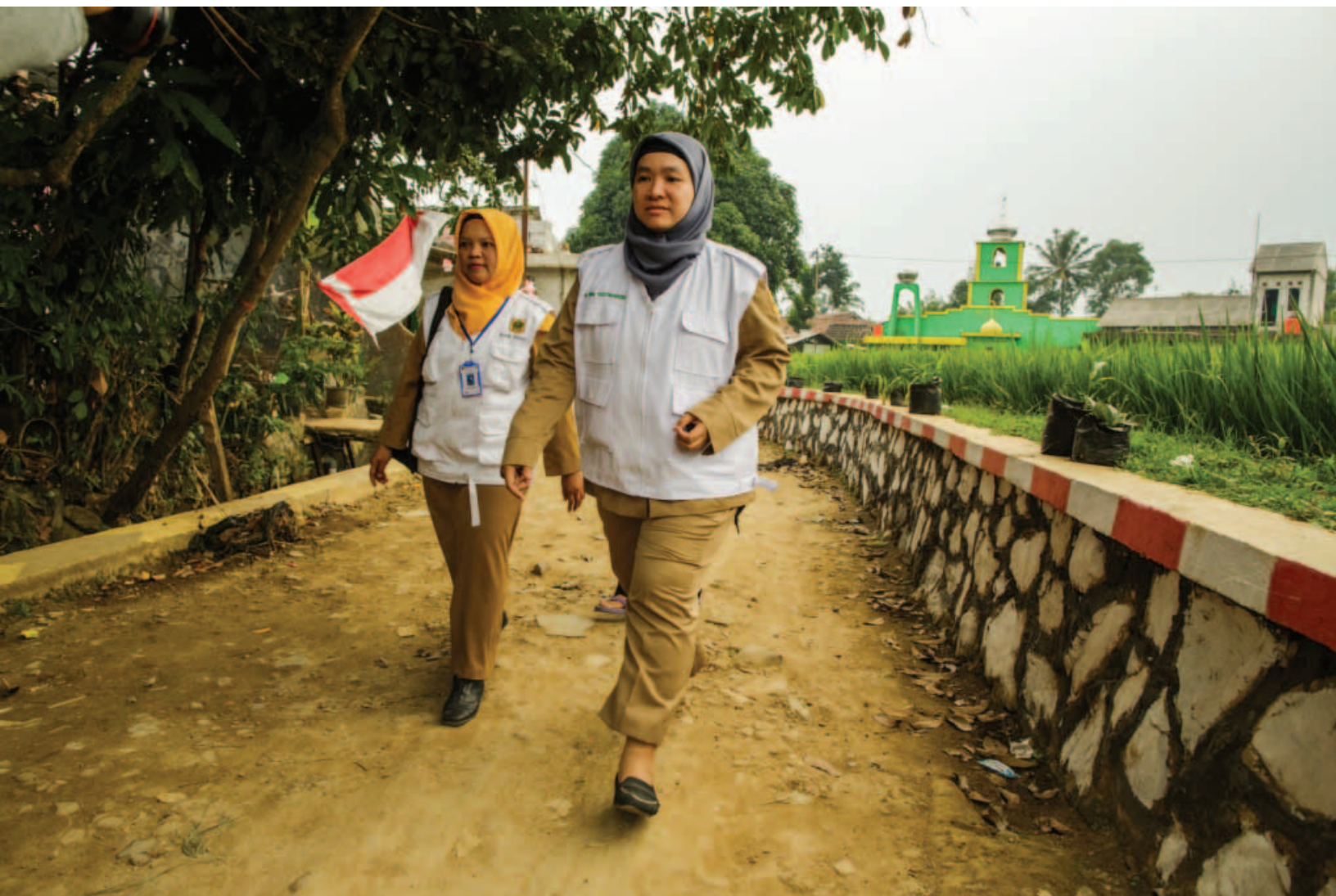
Primary health workers go door-to-door visiting families as part of government community outreach efforts on mental health in Banjarsari village in Ciawi, Bogor, Indonesia.