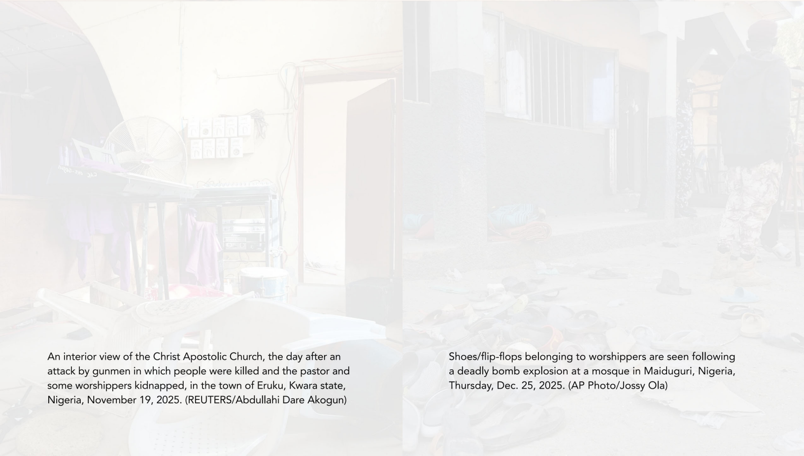
An interior view of the Christ Apostolic Church, the day after an attack by gunmen in which people were killed and the pastor and some worshippers kidnapped, in the town of Eruku, Kwara state, Nigeria, November 19, 2025.