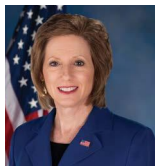
Vicky Hartzler, Chair

Appointed by Speaker Mike Johnson (R) for a term expiring in May 2026. Hartzler served in the U.S. Congress from 2011 to 2023, representing the 4th Congressional District of Missouri. She served on the Armed Services Committee and the Congressional-Executive Commission on China. She sponsored the Combatting the Persecution of Christians in China Act.