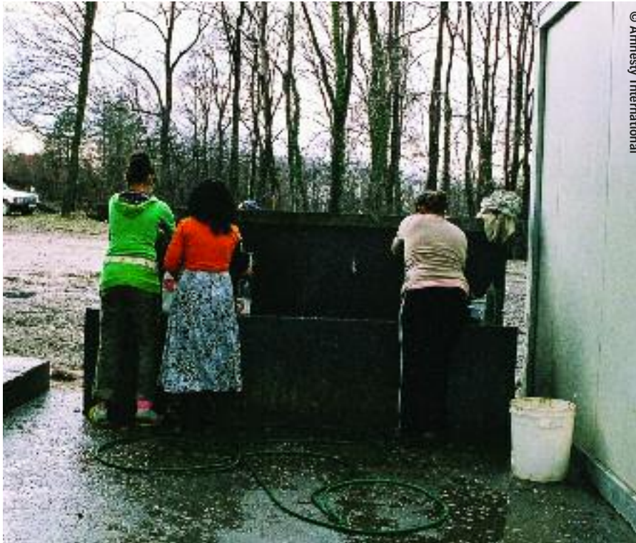
left: Shared facilities for washing clothes and dishes at the Barajevo container site, February 2010.