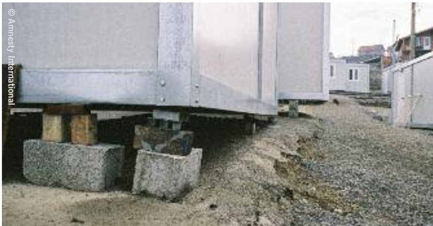
left: The containers in Orlovska Naselje provided for families evicted from Gazela Bridge are unstable and packed closely together, 2010.