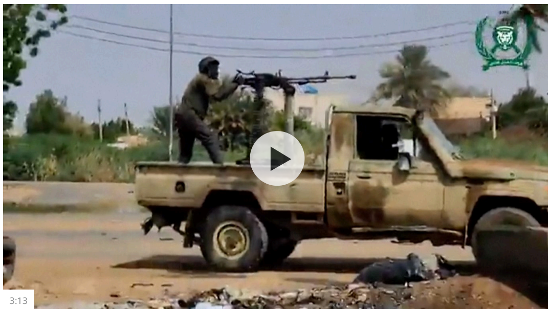
Sudan war: El Fasher residents speak of fear and uncertainty