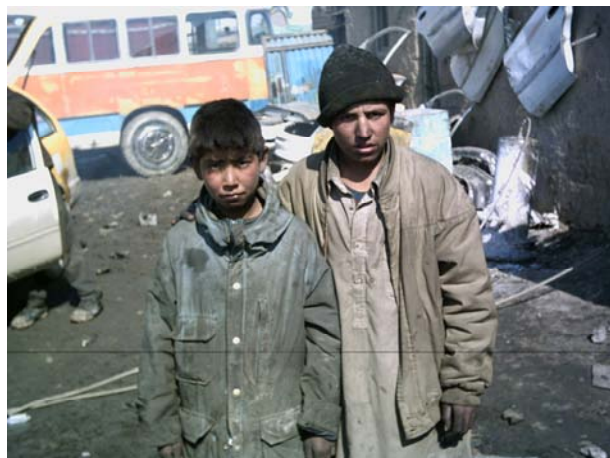
Child labour and street-kids in Kabul

Due to the particularly widespread and deep vulnerabilities of women and children in Afghanistan, the AIHRC has two units dedicated to improving the protection of their rights. The CRU strategy has been to focus on building and working through strong networks to ensure coordination in advocacy and promotion actions. The CRU has focused on coordination and supporting other organisations, and advocating through networks or single-issue committees, thus allowing a broad range of organisations including government agencies and NGOs to work together. One example is the Combating Drug Committee, led by the Ministry of Narcotics, in which the AIHRC has been able to insert child rights and needs into analysis and planning.