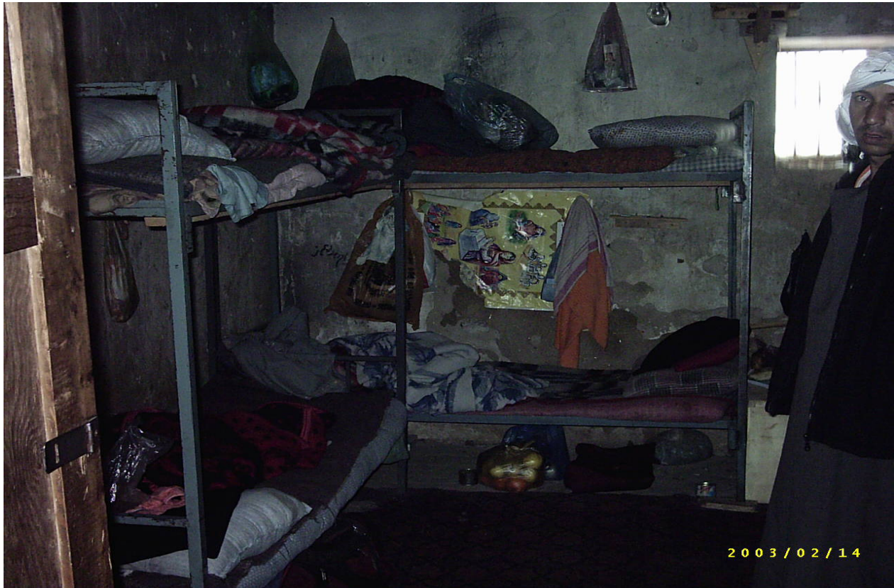
Photo of cell in Kapisa prison. Each cell has 8 beds, and is built into the ground, allowing very little fresh air and light. Torches are needed to move around the prison. Approximately 35 men are incarcerated here.

INSERT PHOTOS OF PRISON CONDITIONS WITH DESCRIPTIONS