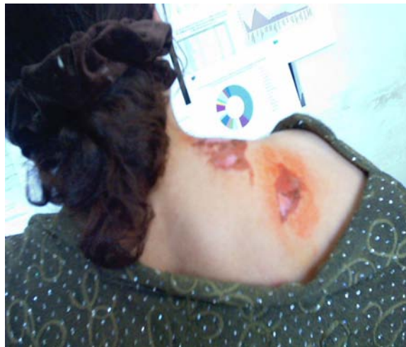
Woman victim of burning by her husband

The WRU has supported the protection of women's rights through researching the causes and nature of women's human rights violations, and advising women who have complaints of abuse. Most of the complaints of human rights abuse from women were related to domestic abuse such as forced marriage and child marriage and were forwarded to the M&I Unit to address. Investigations and awareness raising have taken place in response to the large number of cases of self-immolation by women. The Unit completed research of domestic violence in Afghanistan in a report that was released in March 2005, titled Family Violence Against Women . The research surveyed 1000 women from 20 provinces and found that 50% had experienced physical violence and 50% had experienced psychological torture.