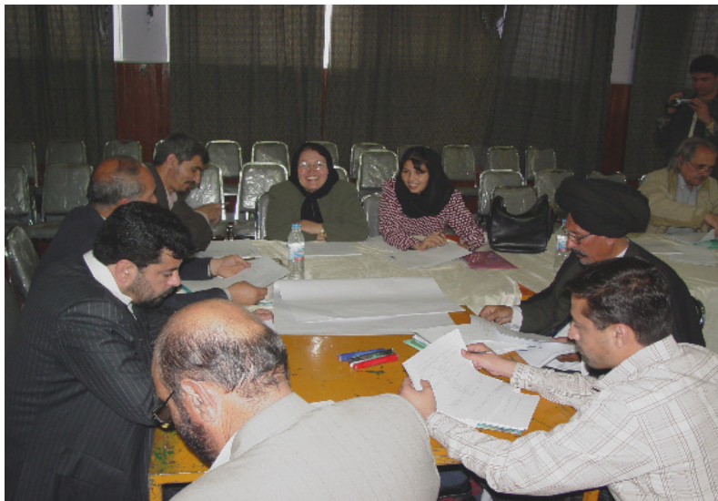
AIHRC staff and members of civil society in a working group to build the 3 Year Action Plan

The draft action plan was further developed through meetings with senior government officials, NGOs, academic institutes and lawyers and clerics. The draft was then thoroughly reviewed by the Commissioners and Executive of AIHRC, recommendations from the external evaluation incorporated and a budget line formulated. The action plan was presented to donors on 23 rd May 2005.