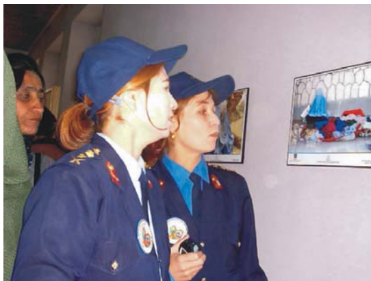
Afghan female air force officers at photo Exhibition of Afghan women On 8 th March 2005

The WRU conducted 66 workshops on CEDAW and other international instruments for women's rights, in the past year, A total of 2,845 women and men participated in the workshops. On International Women's Day, the WRU also held a photo exhibition on Afghan women in the family and society. The exhibition was also shown in Geneva, Switzerland.