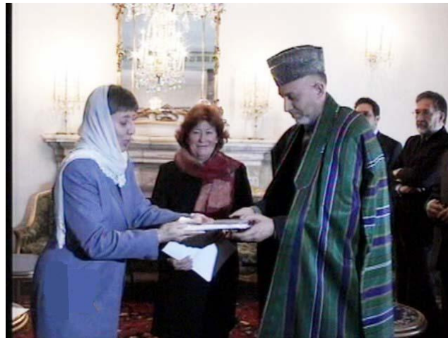
President Karzai is presented with A Call for Justice report by the Chairperson of the AIHRC, Dr Sima Samar

Feedback from the Afghan public has been very positive and supportive, though not without question. One significant and repeated challenge has been why the AIHRC did not name the alleged war criminals within the report. In expected contrast, there has been opposition from some powerful political figures who claim that the report is an attack upon their specific political groupings. These individuals have called for their amnesty, and have sought to weaken the position of the AIHRC and its Commissioners. Their public stated position has encouraged nationwide debate of transitional justice and the Call for Justice recommendations, which has illustrated a high level of support for the recommendations put forward by AIHRC, resulting in a weakening of the position of those who opposed the AIHRC's recommendations.