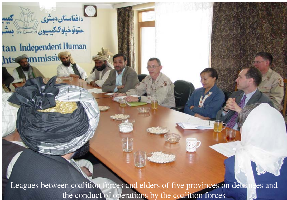
Meetings between coalition forces and elders of five provinces on detainees and the conduct of operations by the coalition forces

In mid May, the AIHRC mediated a difficult but important meeting between the Coalition Force representatives including the US Kabul Embassy representatives, and elders of five provinces of Khost, Paktia, Paktika, Ghazni and Logar to discuss concerns related to detainees by CF, and CF methods of conducting operations.