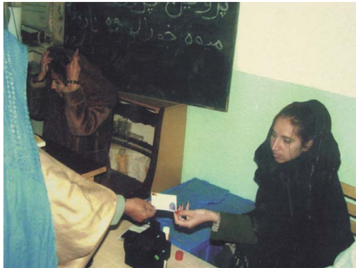
A woman receives her first voter registration card