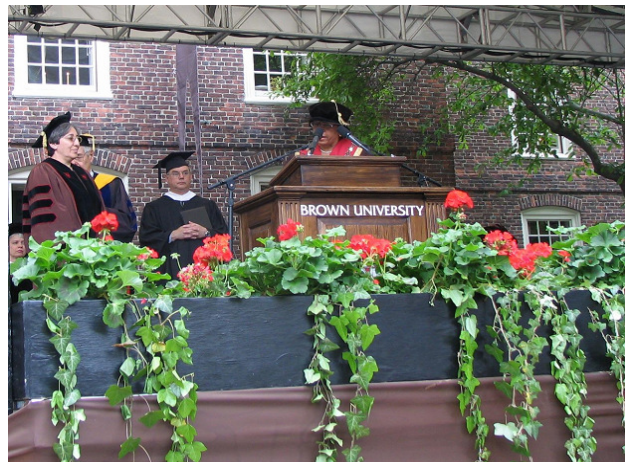
Dr Sima Samar receiving a Doctorate of Human Letters from Brown University, USA

The APF Secretariat has also supported the AIHRC, and sent a formal letter of support for the AIHRC to President Karzai to support inclusion of the AIHRC within the new Afghan Constitution. APF Secretariat also facilitated capacity building of a staff member within the NZ HR Commission.