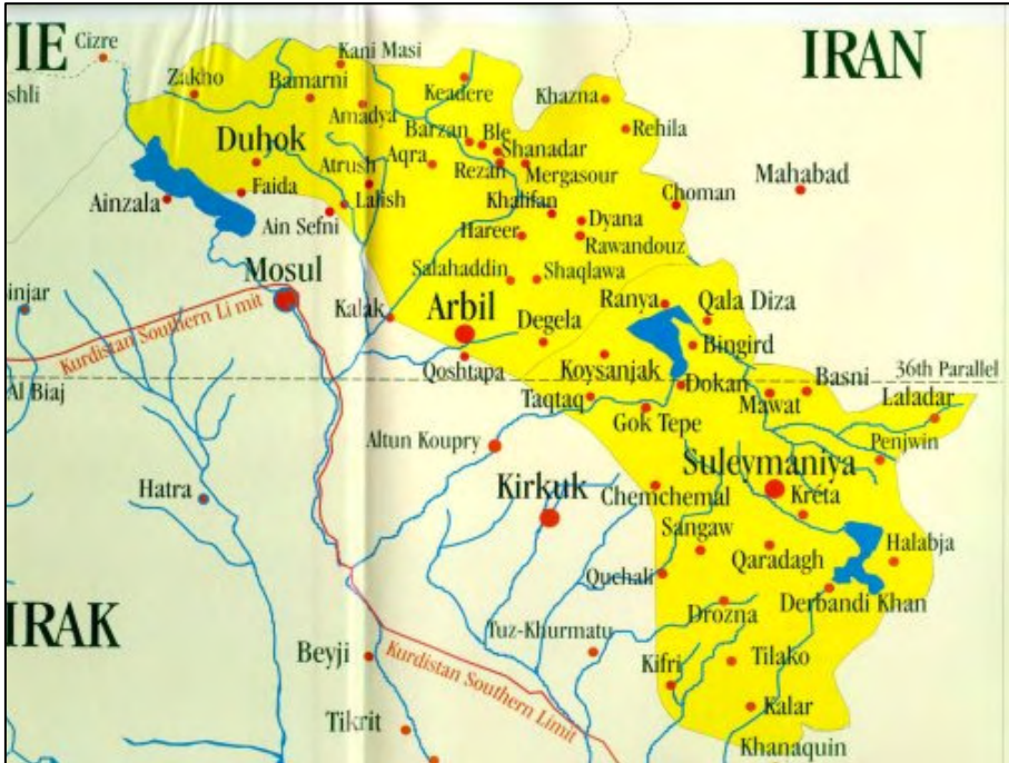
1.09 Global Security Map, last modified 24 February 2006. [83a]