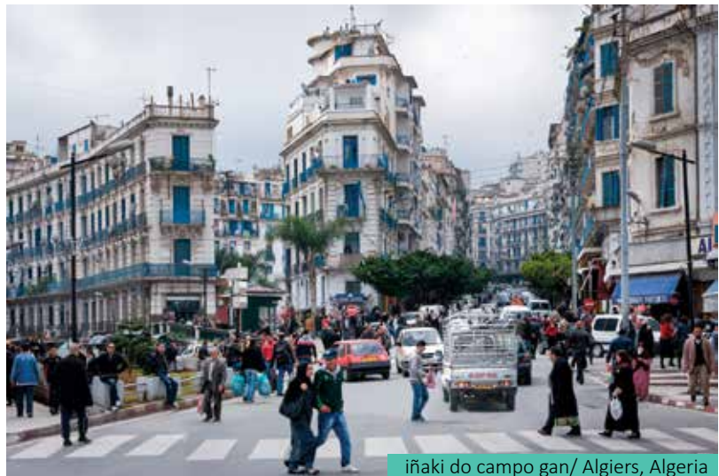
iñaki do campo gan/ Algiers, Algeria

In the decades prior to the establishment of equal nationality rights for women and men, activists emphasized the Nationality Code's incompatibility with the Constitution, which mandated the equality of all citizens without discrimination on the basis of sex. They also highlighted the serious negative impacts of the law on the families of Algerian women, especially children. In addition to other hardships and rights violations, these children suffered from their inability to access social services, educational opportunities, and employment in a number of sectors, including the civil service, a major sector for employment in the country. Many children, who could not access their father's nationality for a variety of reasons, were rendered stateless, resulting in even greater violations of their fundamental rights, including freedom of movement.