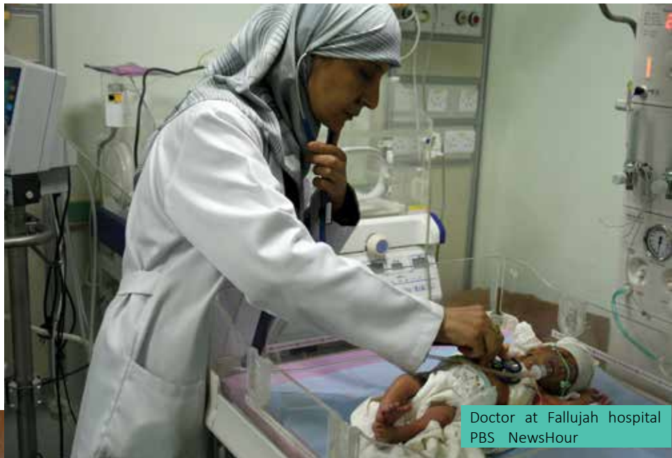
Doctor at Fallujah hospital

Upholding women and men’s equal right to confer nationality not only advances the health of their families, but supports the health of the nation, through preventive care and the treatment of communicable diseases.