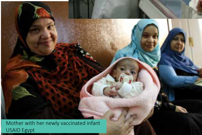
Mother with her newly vaccinated infant USAID Egypt