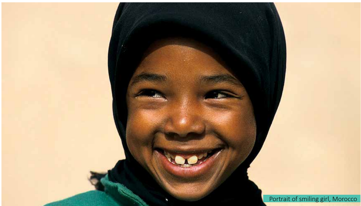
Portrait of smiling girl, Morocco