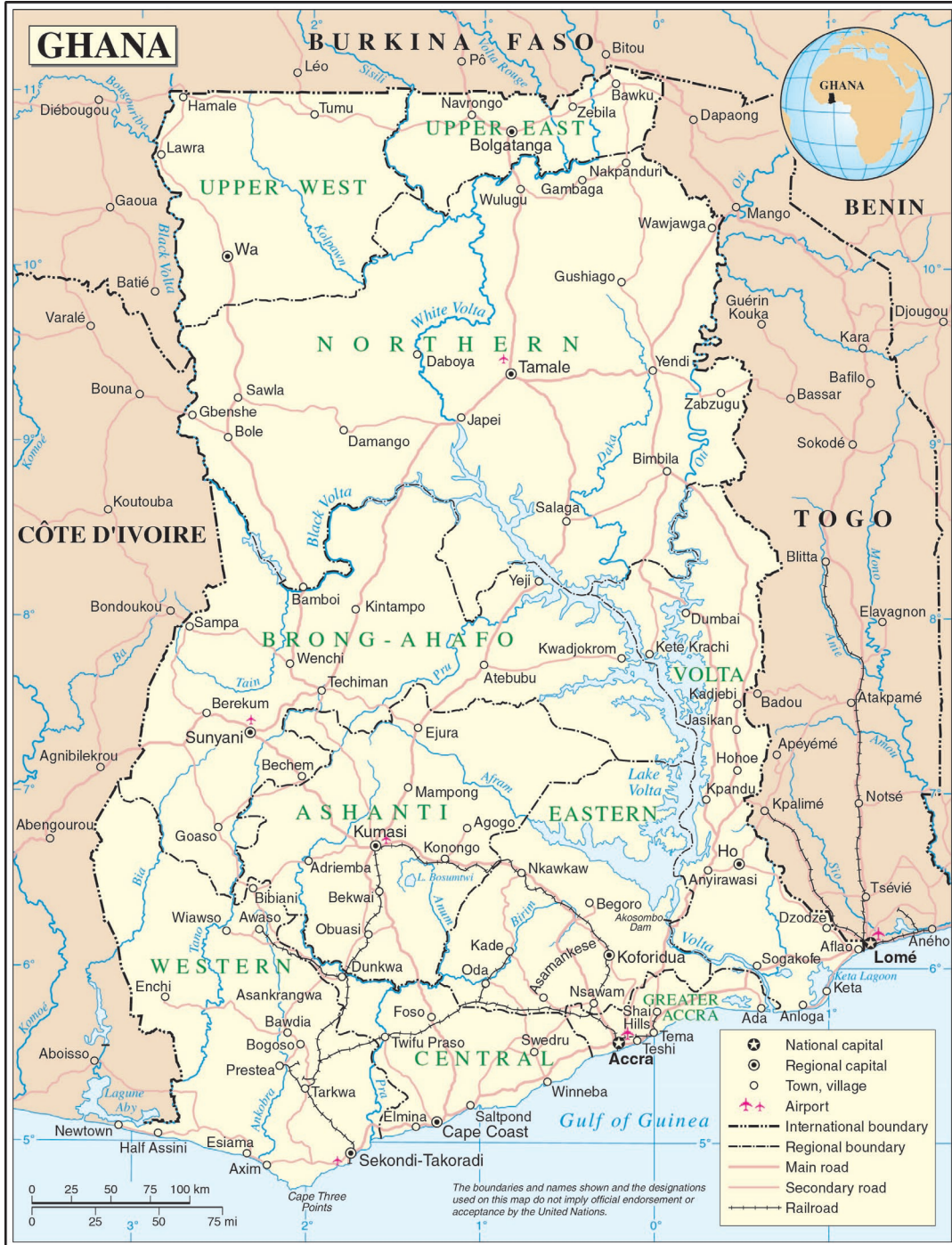
Map 1. Ghana, © United Nations 5