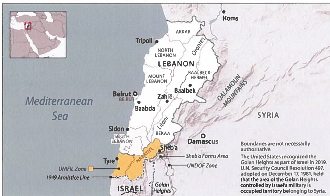
Figure 1. Lebanon at a Glance

Sources: Created by CRS using ESRI, Google Maps, and Good Shepherd Engineering and Computing.