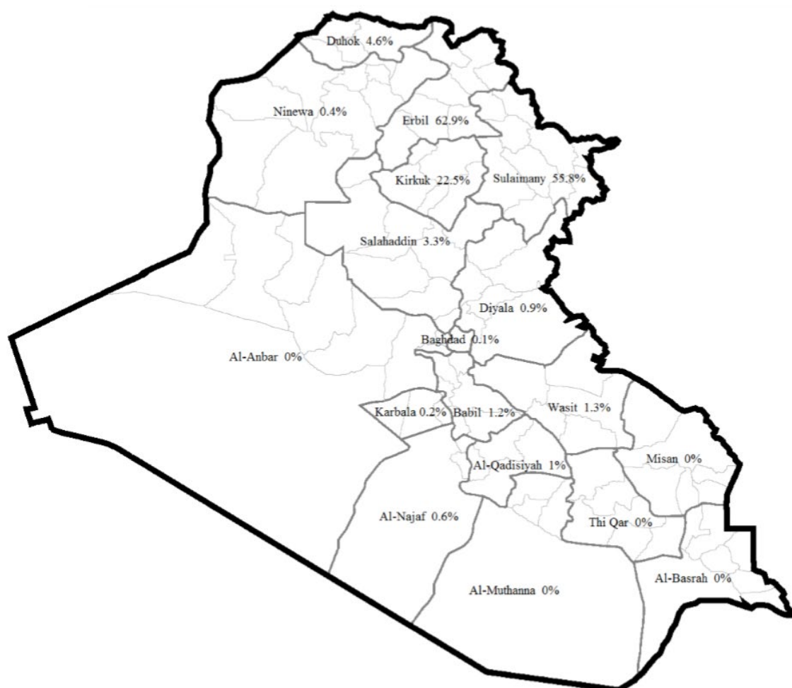
Figure 1. Prevalence of female genital mutilation in all governorates of Iraq, including the three governorates of the Kurdistan Region of Iraq. 14

5.1.1 A study carried out and published in October 2019 looked at the geographical variation in the prevalence of FGM in the Kurdistan region of Iraq using data obtained from the Multiple Indicator Cluster Survey (MICS) conducted in 2011. The study produced a number of graphics to display the varying levels of prevalence across Iraq as a whole and across the different districts in the governorates in the IKR and are shown below. It should be noted that a more recent MICS has been carried out (and is mentioned below) but no comparable graphics were found during CPIT's research.