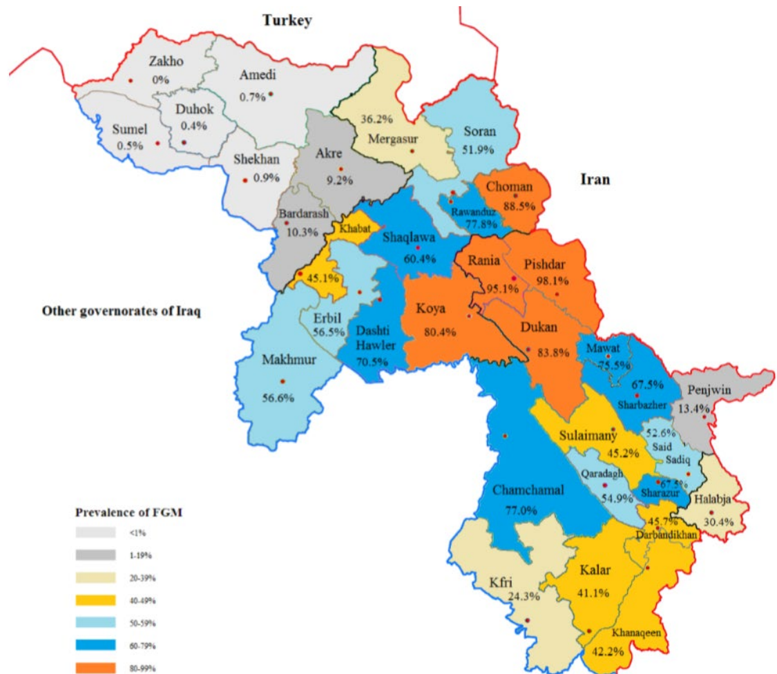
Figure 2. Prevalence of female genital mutilation in the districts of the governorates of the Kurdistan Region of Iraq 15