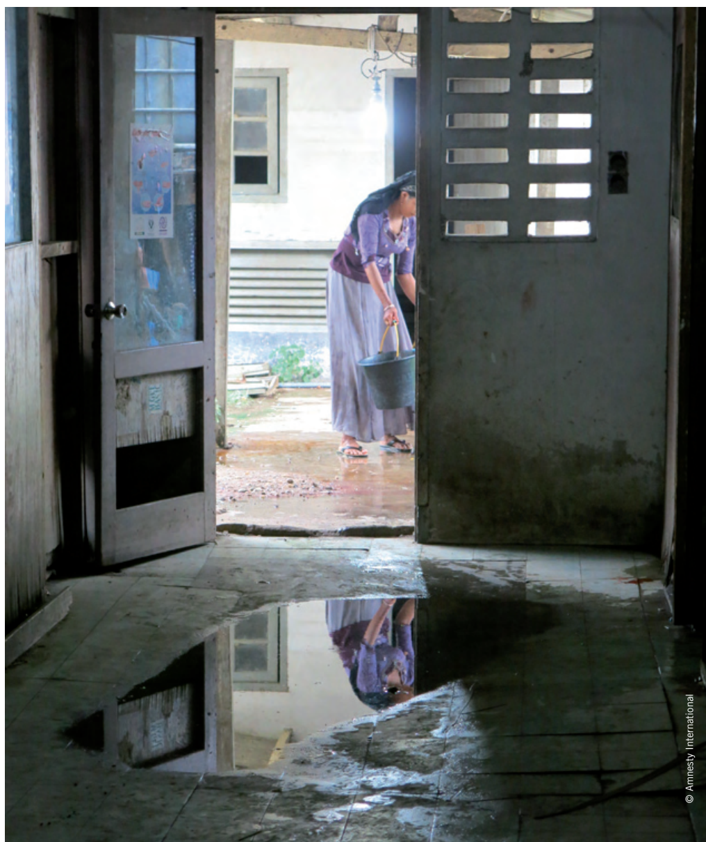
The hallway of the women's quarters at a shelter for Rohingya asylum-seekers in Aceh.

Several weeks after Amnesty International's research at the Blang Adoe shelter in Aceh, there were media reports about the beating and rape of the Rohingya by local residents. Following the alleged rapes, including of a 14-year old girl, more than 200 Rohingya left the shelter but eventually returned. At the time that this report was being finalized in mid-October 2015, local police said that they were investigating these reports. 181