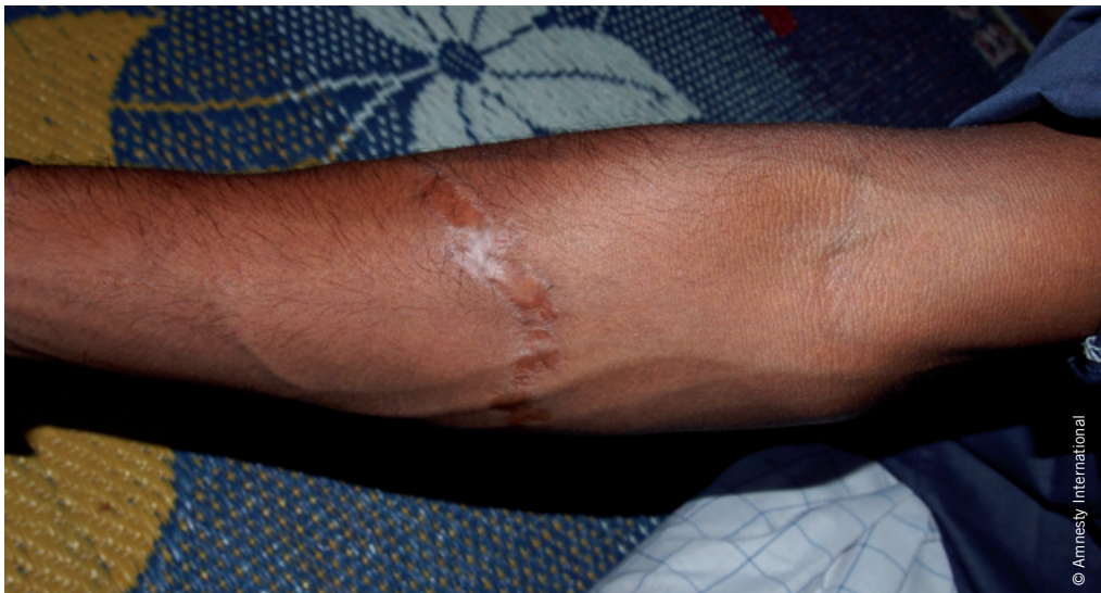
A Rohingya man showing a scar he said he sustained from a knife attack that took place in Myanmar in 2012.

Several interviewees said that their family members were killed and/or disappeared during the 2012 violence. A Rohingya businessman from Molek told Amnesty International that his 50-year old aunt was killed by police in June 2012; an eye-witness told him that she was stabbed with a knife in her side, and her body was taken to the monastery but never released to her family. At around the same time, his two teenage nephews were captured by a mob and never seen again. He called the police to inquire about his nephews' whereabouts, but the officer told him: " Kala , I cannot do anything for you." 31 A 19-year old woman from Sakki village said that in June 2012 her husband received knife wounds during the attacks, and she believes he died: "We cannot find his dead body. It disappeared." 32 A woman from Santolli village told Amnesty International that her eight- and seven-year old children disappeared during the June 2012 violence; she fears that they are dead, saying: "I never saw their bodies." 33