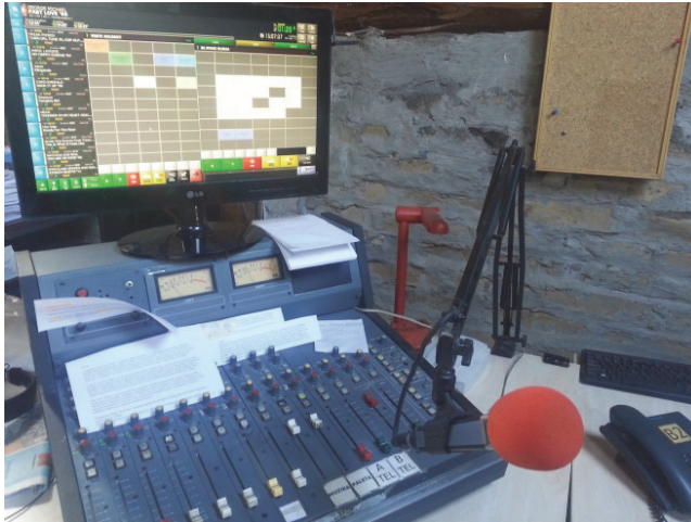
Interior of Radio 021 studio in Novi Sad, Serbia. October 4, 2014.

officials [ruling Serbian party] boycotted my show. Officially, they didn't tell me why but I was told by sources in SNS that they [regional SNS officials] had been instructed to boycott my show... I understood it as political pressure that I was pushed into a corner and I would have been forced to be one-sided in my reporting. As a result I decided to leave journalism because there is no space for independent journalists. 122