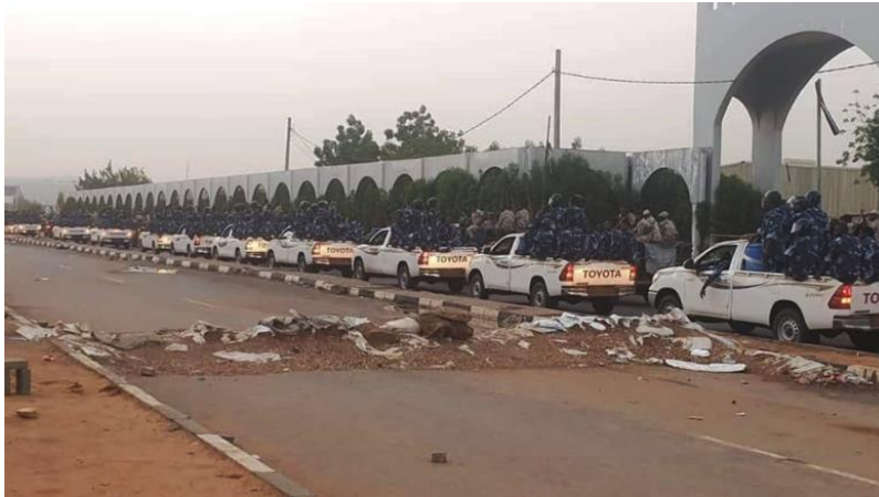
↑ Soldiers in pickups in front of the army headquarters Khartoum on 3 June

subway. I saw soldiers from the RSF on top of the railway firing live ammunition. We decided to retreat towards the Air Force gate. There, we saw brand new pickups coming from the southern direction along the road opposite the army headquarters. These pickups were carrying troops wearing police uniform. Then we retreated to El Baladyia Avenue where we found many injured people. Soldiers in front of the Air Force gate started to run towards us with sticks and whips, some carrying guns. I saw a girl injured near the first barricade in El Baladyia Avenue. We ran until the Constitutional Court where there were soldiers on both sides of the road; they beat us with sticks. We were hundreds running; there were many injured people with us. By that time, it was around 8:30 or 9:00am.”