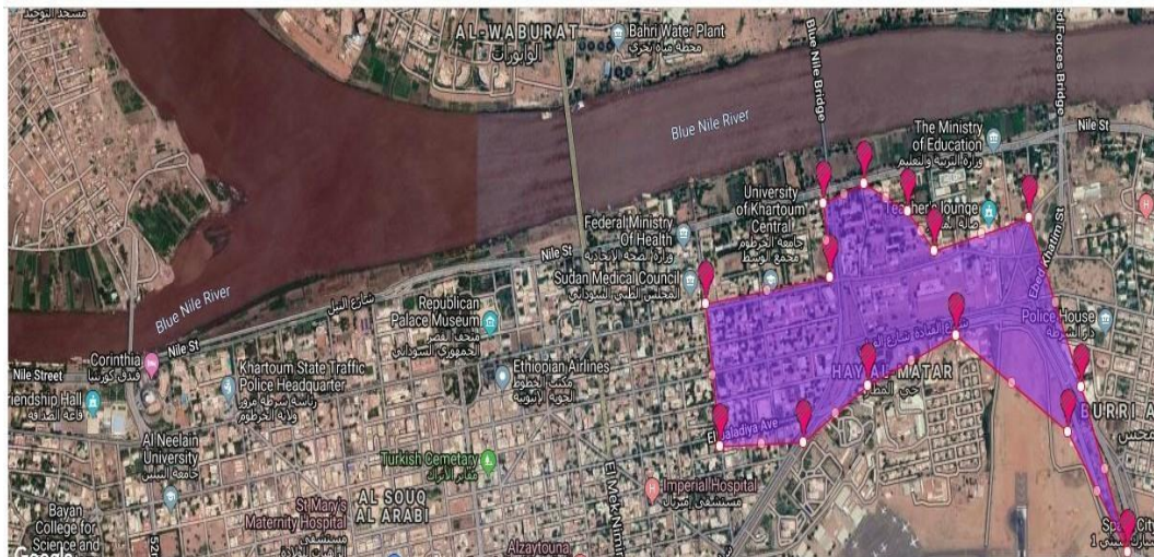
↑ Sit-in area map in October 2019

The sit-in area in front of the army headquarters was a vast area covering at least one square kilometre. It was located east of Central Khartoum. It spread from the Army Bridge in the East, to the University of Khartoum in the West, and from the North it stretched south of the Nile street to the Army Command street and the north wall of Khartoum airport and extended to the Nahla petrol station in the south-east. The sit-in area contained at least 131 tents and sites representing different groups that participated in the protests. Several improvised barriers were erected across Al Gamaa, El Baladiya, and El Gumhoriya Avenues and Abdel Rahman Al Mahdi road, to prevent or delay the movement of possible attacking forces and for security checks. Hundreds of thousands of people gathered in the sit-in area and maintained their vigil. The sit-in area became a hub for political and cultural activities, and it reflected the country's diverse and vibrant culture.