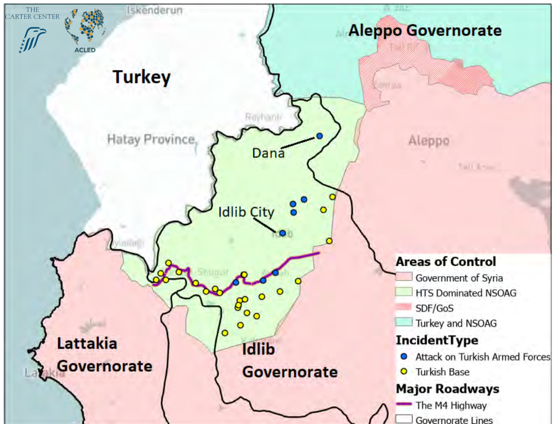
Figure 2: Turkish military bases and attacks against Turkish armed forces in Idlib Governorate since 5 March 2020. Data from The Carter Center and ACLED.