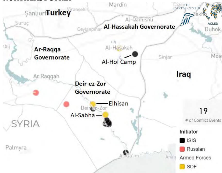
Figure 4: ISIS related conflict events in northeast Syria between 8-14 March 2021. Data from The Carter Center and ACLED.