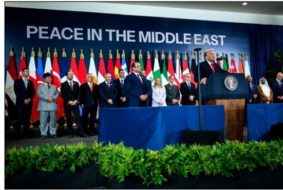
Figure 3. President Trump at the Peace Summit in Egypt October 2025

The ISF shall work with Israel and Egypt, without prejudice to their existing agreements, along with the newly trained and vetted Palestinian police force, to help secure border areas; stabilize the security environment in Gaza by ensuring the process of demilitarizing the Gaza Strip, including the destruction and prevention of rebuilding of the military, terror, and offensive infrastructure, as well as the permanent decommissioning of weapons from non-state armed groups; protect civilians, including humanitarian operations; train and provide support to the vetted Palestinian police forces; coordinate with relevant States to