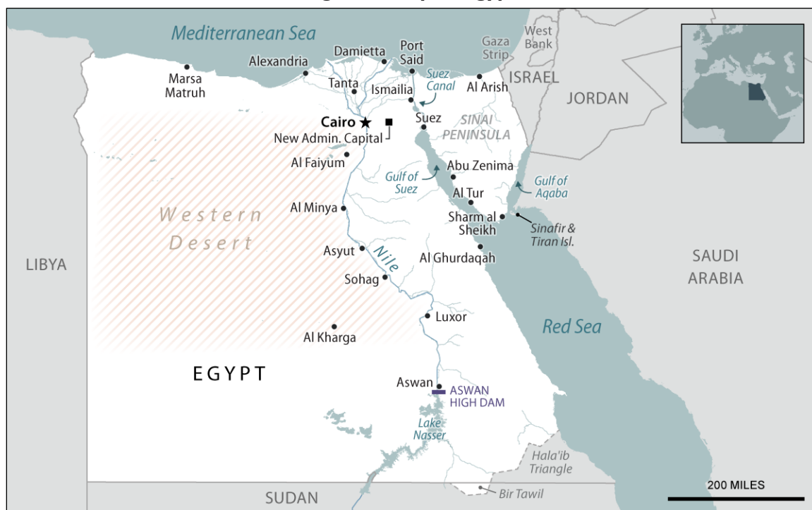
Figure 1. Map of Egypt