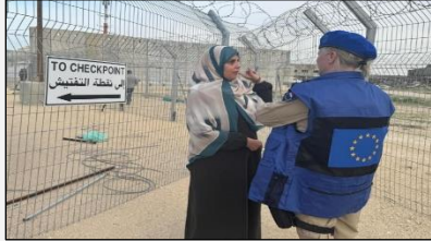
Figure 4. European Monitors at the Rafah Crossing

negotiating over Rafah, Egypt has long feared being inundated with Palestinian refugees; Egypt had rejected President Trump's earlier calls to relocate Gazans outside the Strip. 17 Egypt constructed areas on its side of the border to contain any uncoordinated mass movements of Palestinians.