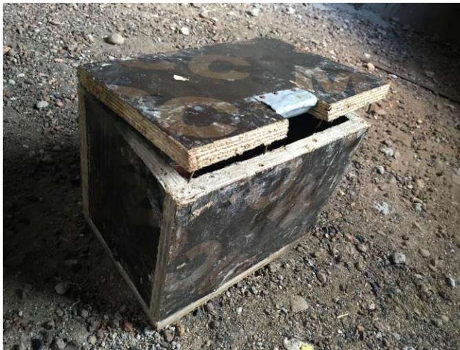
An empty wooden savings box, broken into by government soldiers who carried out massive looting in the Munuki neighbourhood. The family that owned the box lost more than a year’s worth of savings.

The most dramatic single incident of looting was the systematic plunder of the immense World Food Programme (WFP) compound and Food and Agriculture Organization (FAO) compound in Juba’s Jebel neighbourhood, on the Yei road near the UNMISS base. More than 4,500 metric tons of food was stolen from the WFP compound, enough to feed about 220,000 people for a month. 53 In addition, numerous vehicles, generators, and other equipment were stolen, stripped, dismantled and destroyed. Thousands of files were scattered to the wind. A witness who visited the site on 13 July said he saw both government soldiers and civilians there “carrying away heavy-duty generators, parts of vehicles, food, and goods, getting fuel out of fuel tanks, and cutting tents with knives to take them away.” 54 The scale of the pillage and destruction was so enormous that it could not have been done without, at a minimum, a large degree of command acquiescence; too many troops and vehicles were needed to transport the looted goods.