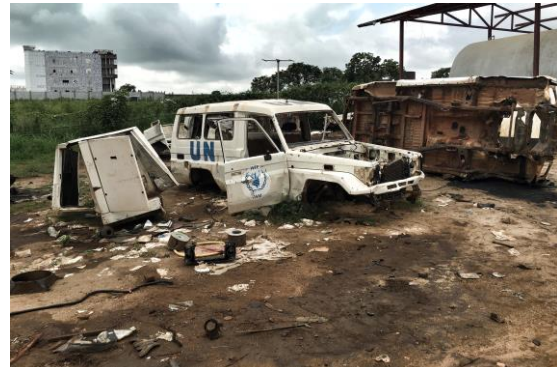
The looted WFP compound in Juba's Jebel neighbourhood. More than 4,500 metric tons of food was stolen from the compound, enough to feed about 220,000 people for a month.