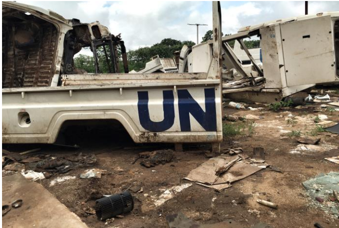
The looted WFP compound in Juba's Jebel neighbourhood. More than 4,500 metric tons of food was stolen from the compound, enough to feed about 220,000 people for a month.

"I personally witnessed the looting in Customs market," a local journalist told Amnesty International. 57 He visited the area on 11 July at about midday. "There were soldiers in uniform breaking into the shops ... The soldiers would shoot in the air to scare away boys so they could loot themselves. You could see people in uniform holding generators or bags. At that time, they knew that no one could stop them."