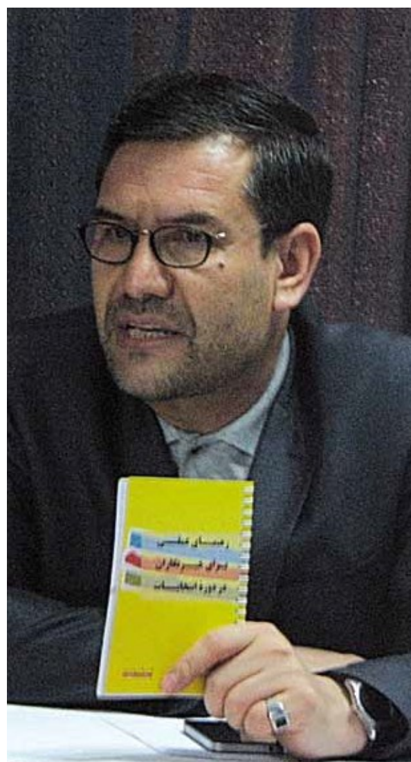
Mobarez Rashedi, deputy information and culture minister