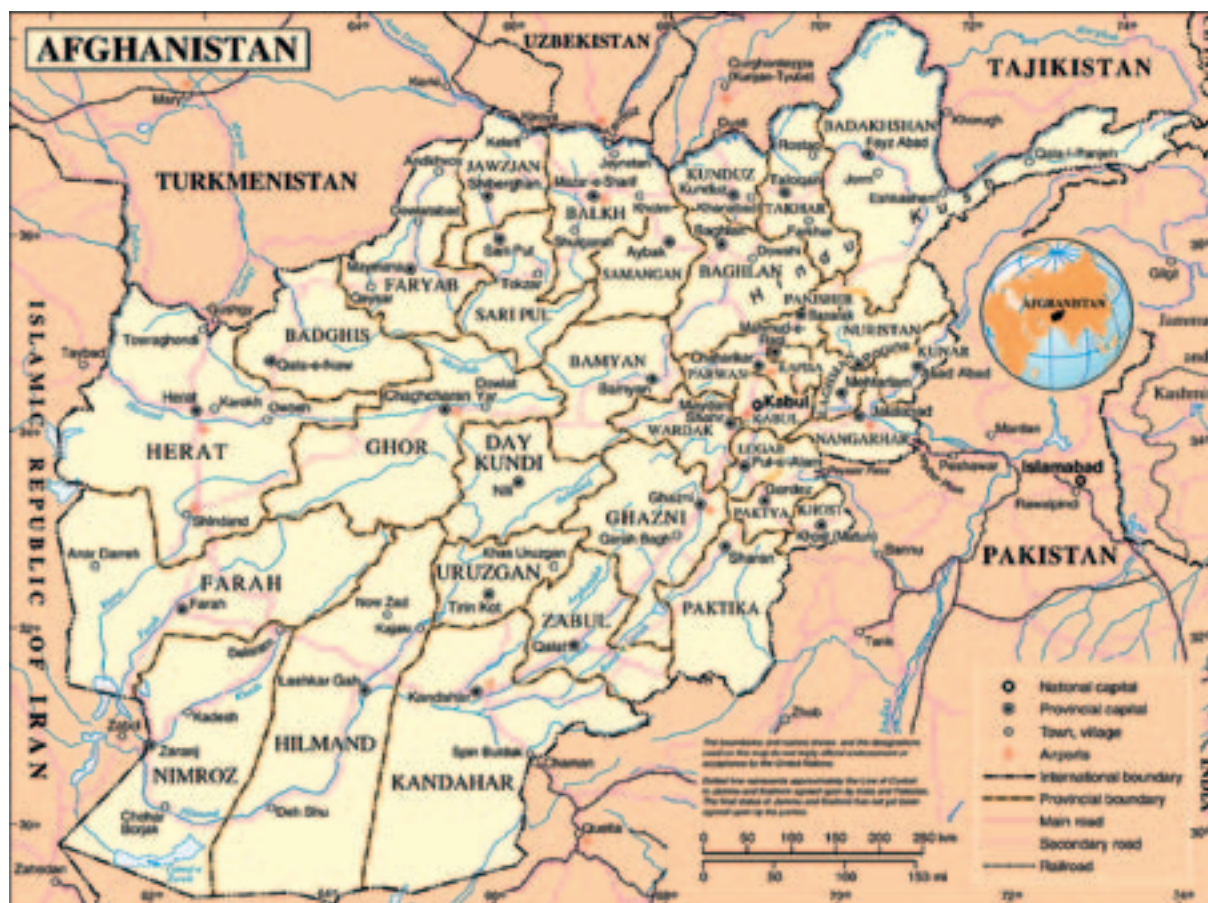
Figure 1: Map of Afghanistan (8)