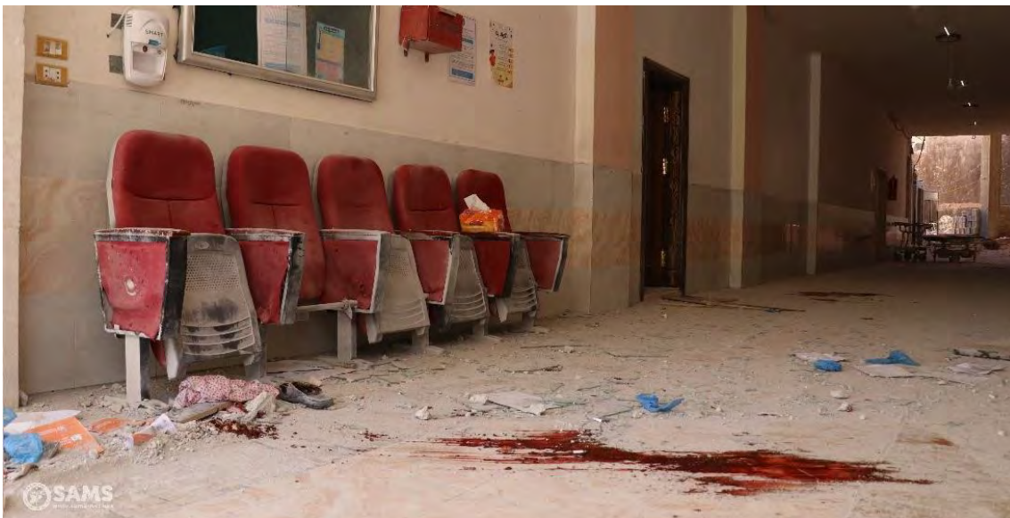
The waiting area in the main corridor of al-Atareb hospital, showing blood from one of the victims of the attack.

Following the first attack, as staff members were helping the injured, and patients were running out of the hospital, the facility was hit two more times. The subsequent attacks resulted in a complete loss of electricity in the facility. All lights and medical devices