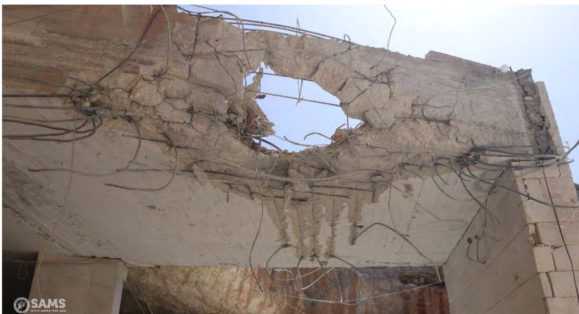
A hole in the ceiling at the front gate of al-Atareb hospital caused by a shell fired during the March 2021 attack.

On March 21, 2021, at 8:41 a.m., three artillery strikes targeted al-Atareb hospital. One of the shells hit the main entrance courtyard, completely destroying the orthopedic clinic housed in the prefabricated structure at the entrance of the hospital. The shell caused structural damage to the windows of the main hospital and the front gate. Another