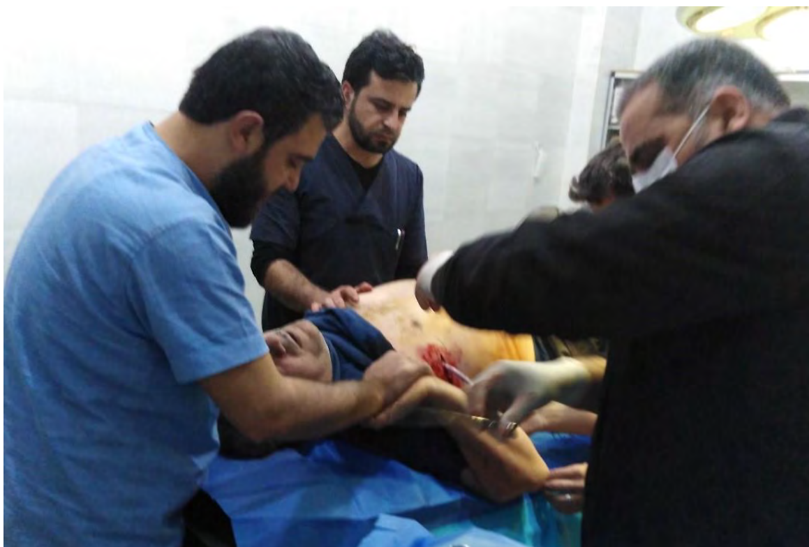
Staff of al-Atareb hospital care for a person injured in the attack.

The attack resulted in seven patient fatalities (five men and two children). An additional 17 people were injured, including five medical staff (one doctor, one technician, one emergency room nurse, one COVID-19 triage nurse, and one infection control technician). At least four of the injuries were critical, and the victims were transported to Turkey for emergency treatment.