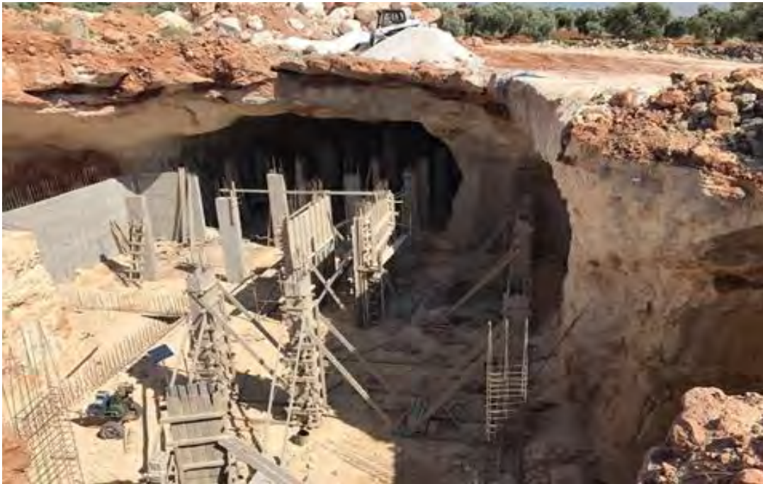
Construction of the new subterranean al-Atareb cave hospital in 2017.

After moving patient services to the subterranean hospital, between April and August 2018, SAMS rehabilitated the old building in the town center as a comprehensive emergency obstetric and newborn care center. The old facility and the new subterranean facility remained operational until the assault on northwest Syria by the government of Syria and Russian forces in late 2019. In February 2020, the hospital administration felt al-Atareb town was too close to the front line for patient and worker safety and decided to evacuate both hospital facilities. In April 2020, the resumption of a ceasefire agreement allowed the subterranean hospital to resume service. The old building was converted into a primary health care center (PHC) at that time, and obstetric and newborn care were transferred to the subterranean facility. A satellite vaccination center in al-Atareb town, providing routine immunization for the children in the area, was established in addition to the PHC.