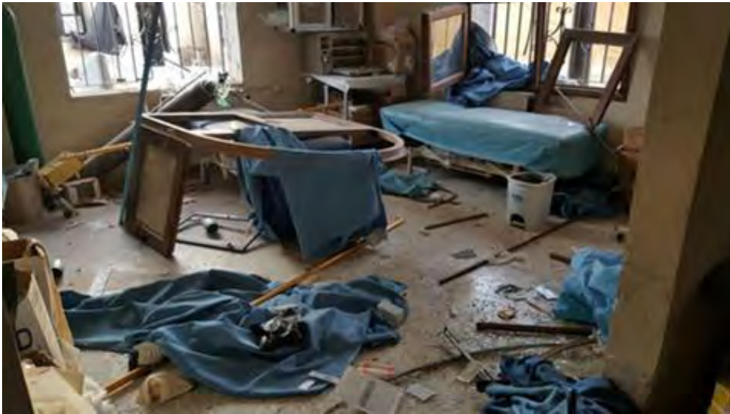
Above and below: Al-Atareb Surgical Hospital, in the aftermath of the November 14, 2016 attack.