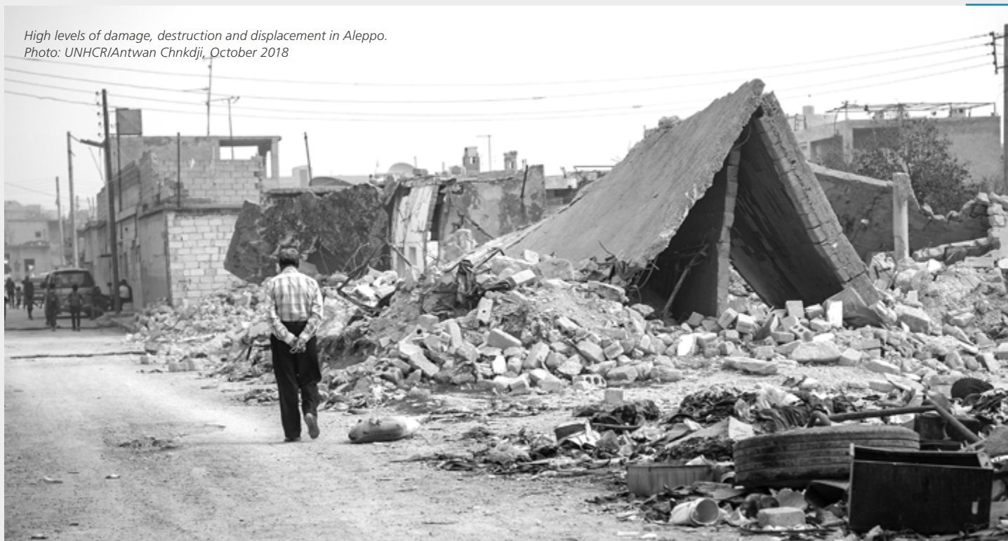
High levels of damage, destruction and displacement in Aleppo. Photo: UNHCR/Antwan Chnkjji, October 2018

compliance, which includes the withdrawal of all heavy weaponry. The agreement may have averted a humanitarian disaster for now, but reports of violations by all parties are a cause for concern. 98 The initial stability it has introduced should be built on to establish a more lasting solution which genuinely protects Idlib's civilians.