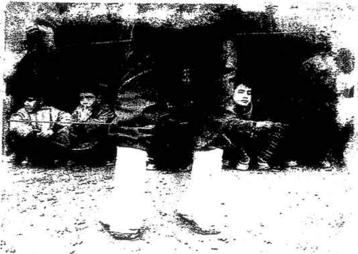
Learning to Live in the shadow of a gun