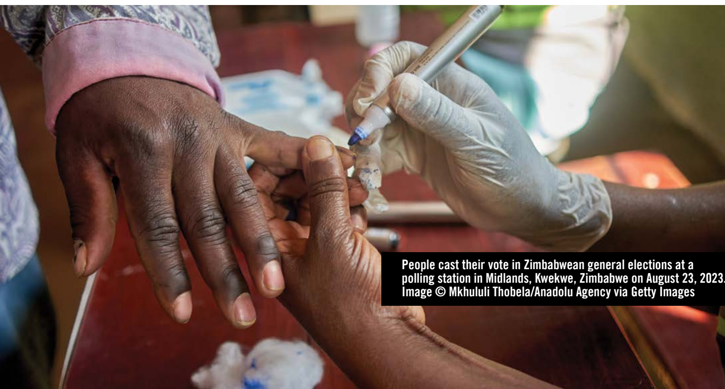
People cast their vote in Zimbabwean general elections at a polling station in Midlands, Kwekwe, Zimbabwe on August 23, 2023.